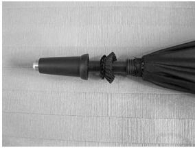
Models U-111 and U-115