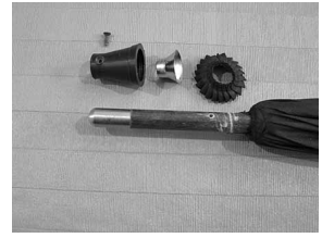
Models U-111 and U-115